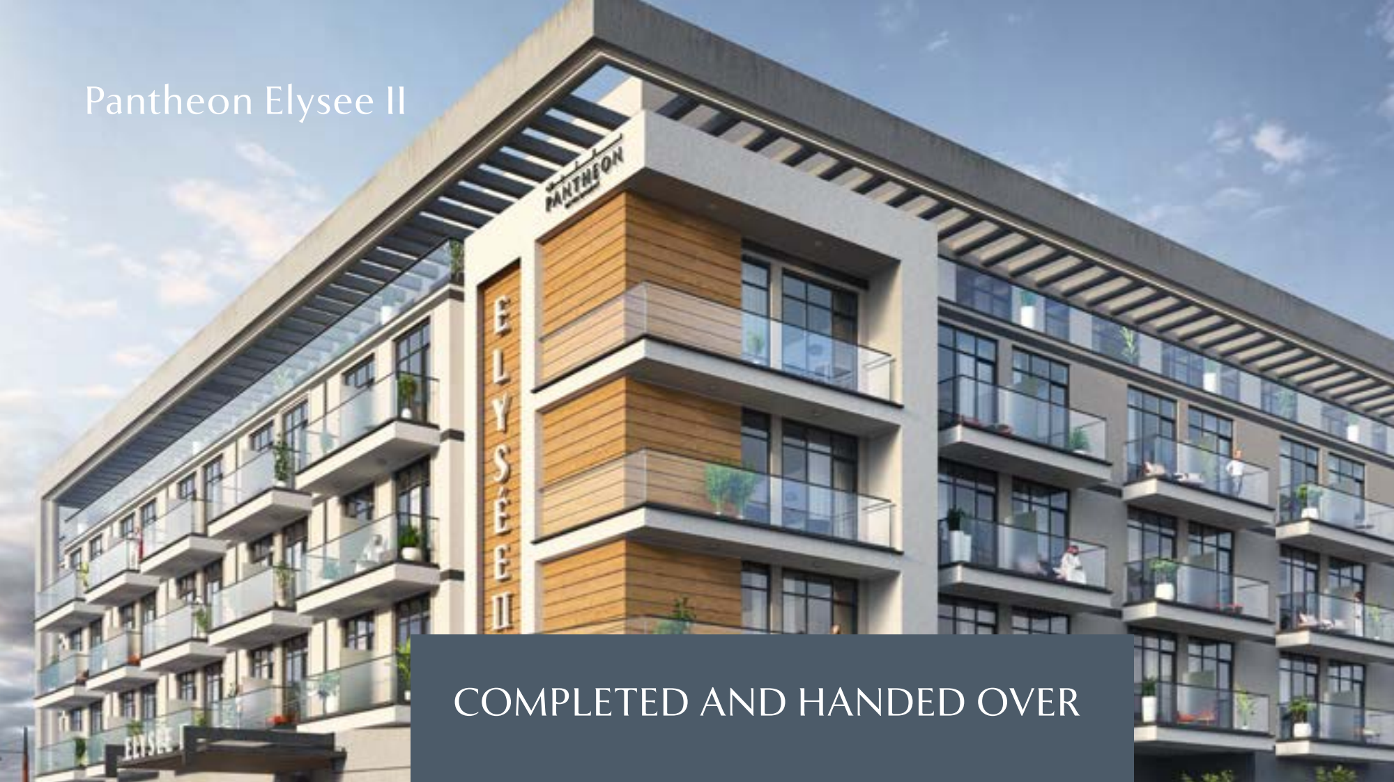
Pantheon Elysee II